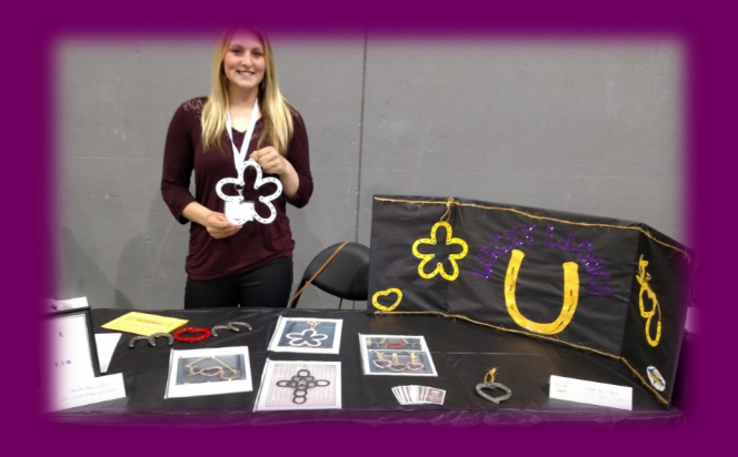
Lucky Ladies, one of five youth businesses developed as part of the 4-H Entrepreneurship Program in Delta County.