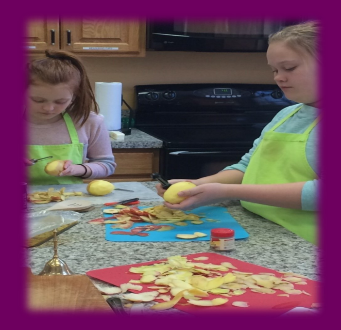
4-H SPIN Club members peeling apples for making freezer apple butter.

Beef: 26 members Horse: 38 members Sheep: 9 members Swine: 93 members