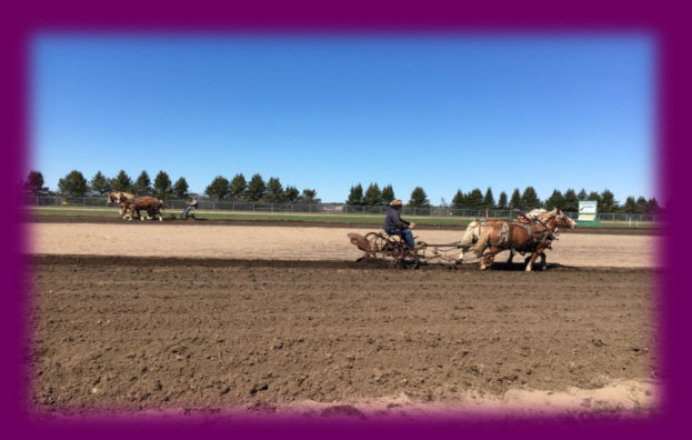
Opening day of the Escanaba Community Garden showcases draft horse tillage.