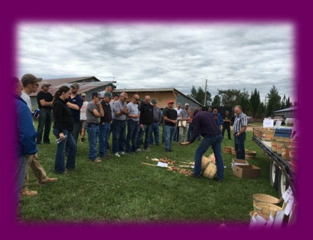
August 2018 Field Day at Verbrigghe Potato Farm in Rock, MI.

MSU Extension also participated in the Project Connect Health Fair and the Home and Garden Show with an informational table.