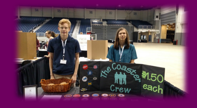
The Coaster Crew, one of five youth businesses developed as part of the 4-H Entrepreneurship Program in Delta County.